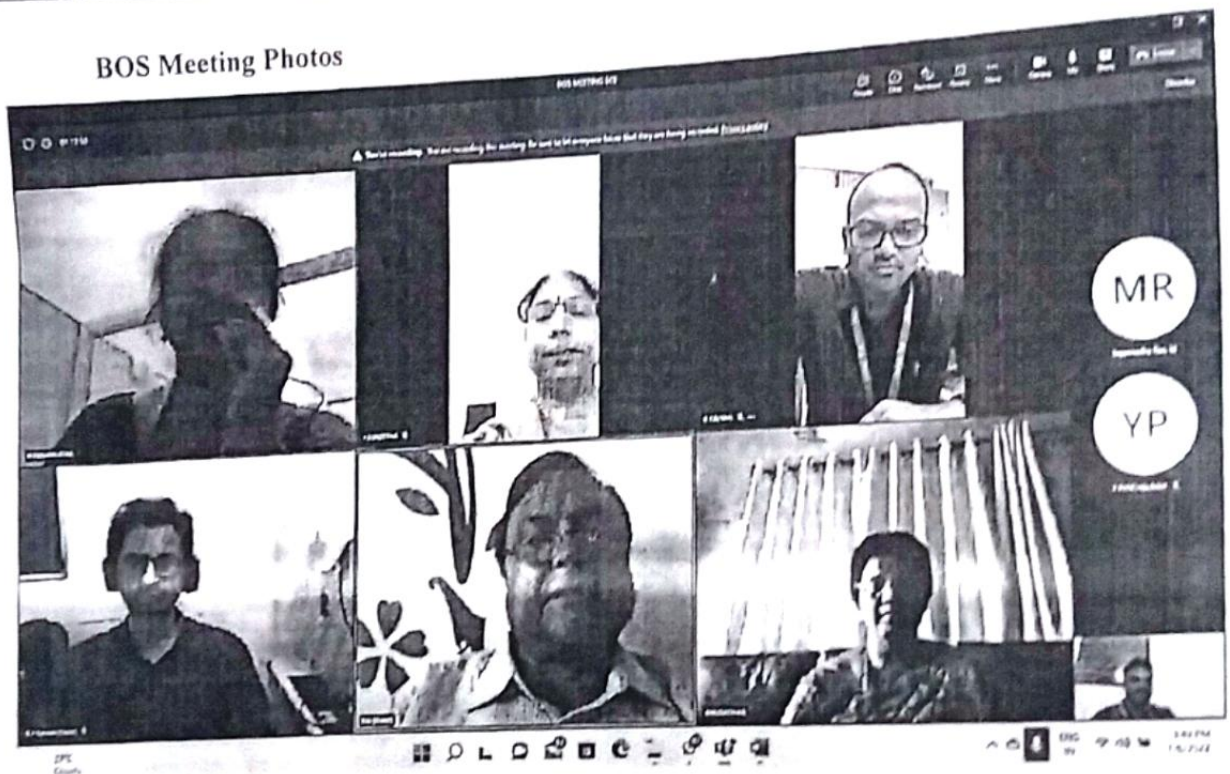
Snapshots of UG & PG BOS-ECE Virtual meeting held on 06-07-2022 at 3PM.