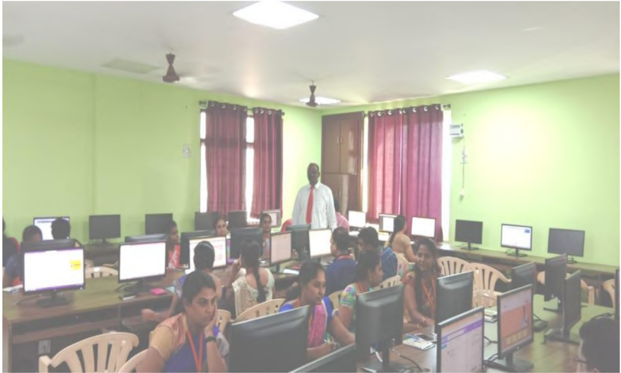
Fig. Participants of the Workshop in the Lab